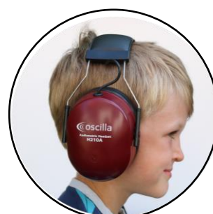
Noise cancellation Headset