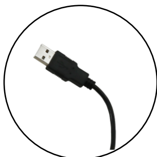
Plug & play via USB