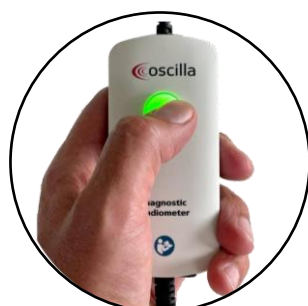
Lightning button feedback